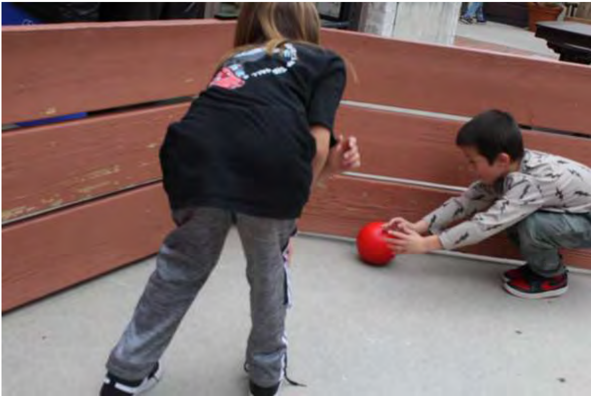
Photograph by Eli, 2nd