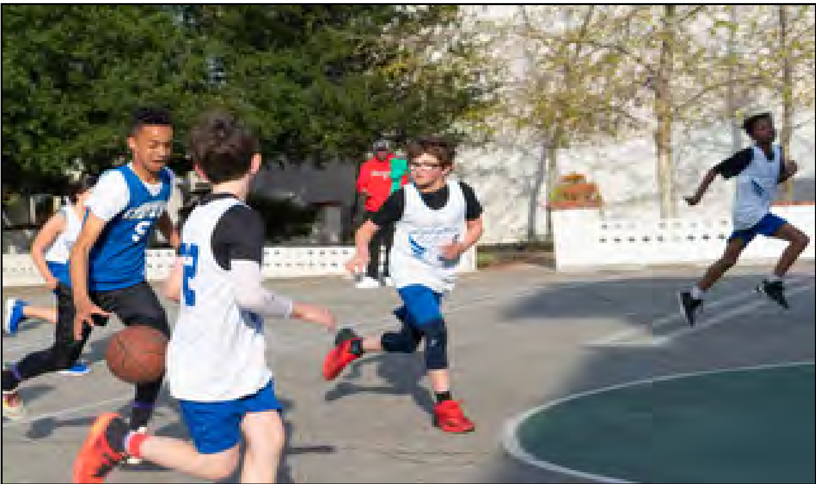
Photograph by Grayson, 4th