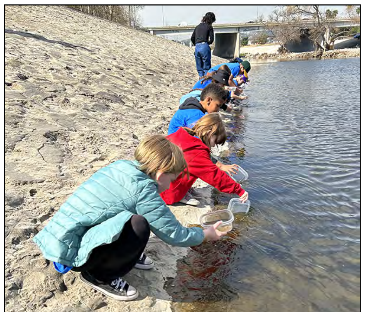
Field trip photos by teachers