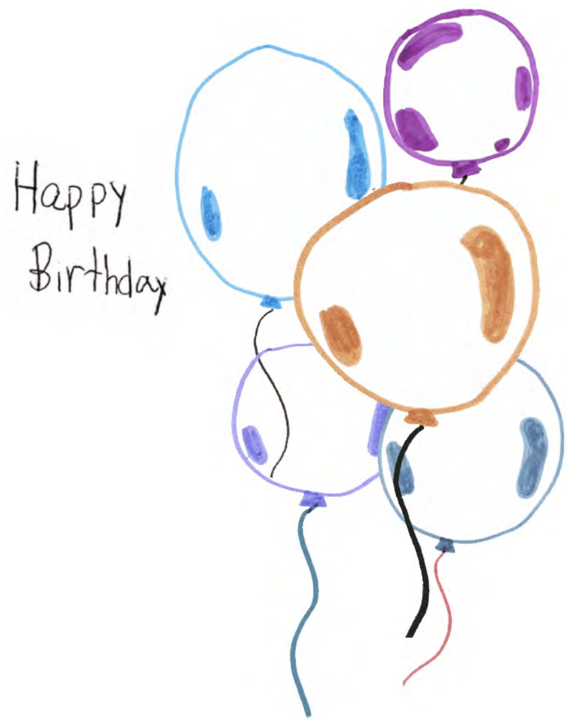
Balloons by Brooklyn, 4th