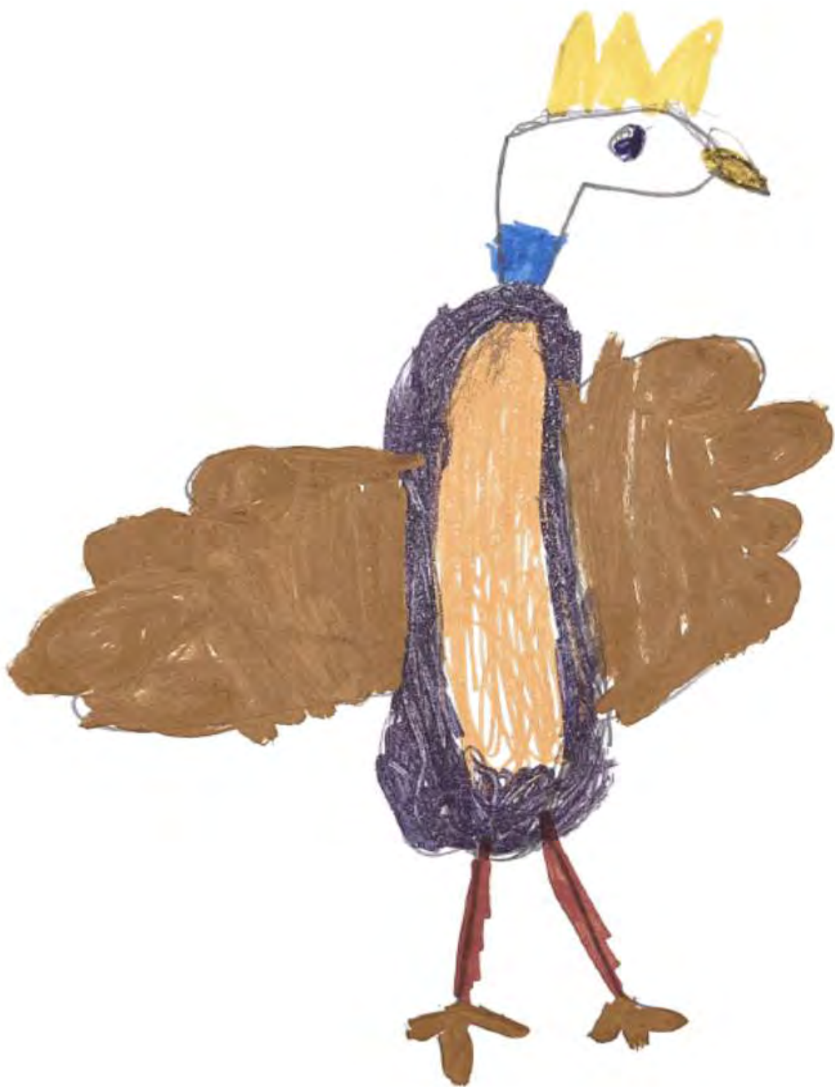
Drawing by Maya R, 2nd