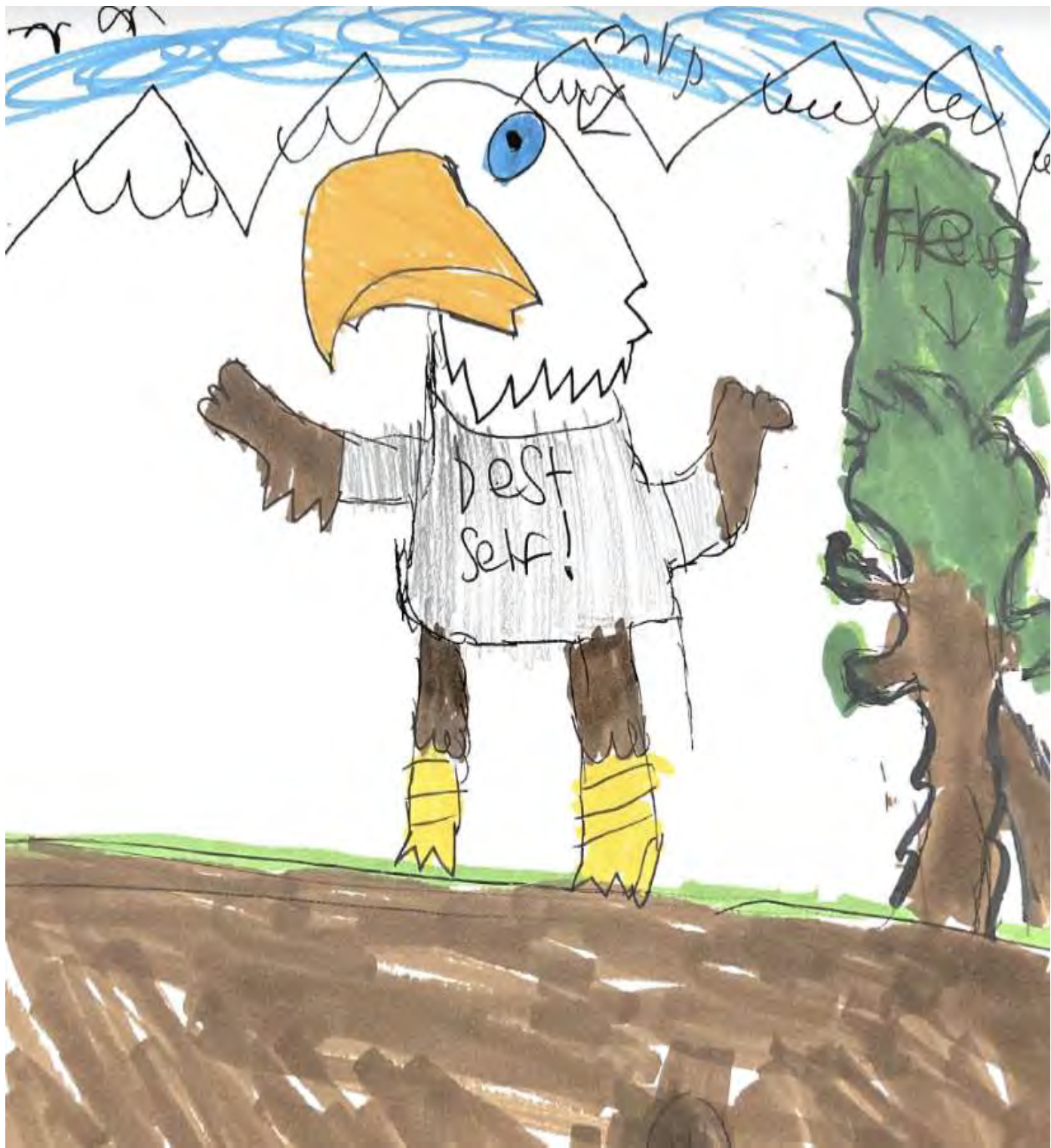
Drawing by Strummer, 2nd